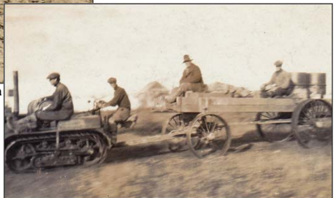
Graphite en route to Imuruk Basin during a test haul, circa 1917; Nick Tweet is seated on the wagon, the others are not identified; photo from the Tweet family collection.

From Graphite Bay, the graphite ore was loaded into scows, towed to Teller, and then loaded onto ocean steamers bound for market destinations, mainly Seattle and San Francisco. The Tweet graphite production amounted to large bulk samples shipped to several market destinations.