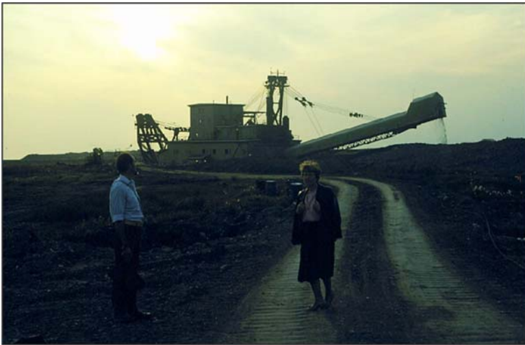
Dredge No. 6, circa 1990