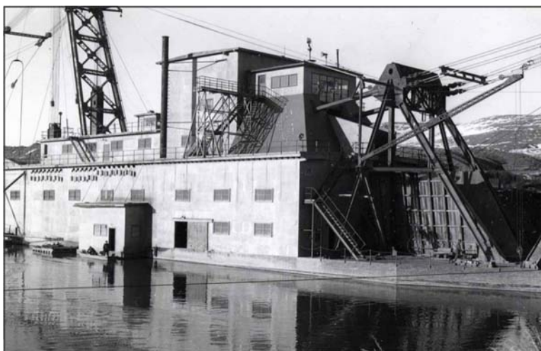
Dredge No. 5 in operation on 3 rd Beach, circa 1957. Dredge No. 5 was the largest on-land gold dredge ever to operate in Alaska.

Zoominfo.com/search . The Nome Nugget. Regional News, Sept 26, 2002. Walter Glavinovich obituary notes