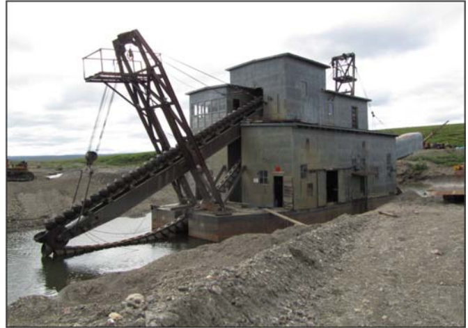
The KCP-Tweet dredge, ready to dig, circa 2010; photo from the T.K. Bundtzen collection.

terrace at Taylor will provide years of reserves for the dredging operation. In 2010, the Tweet dredge was believed to be the only operating bucketline stacker gold dredge in North America.